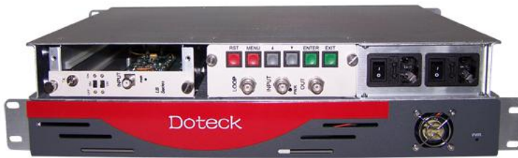
4-slot, 19-inch, dual power supply