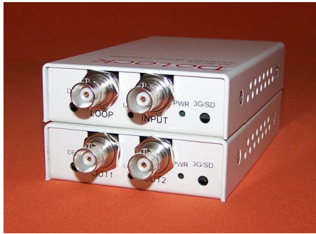
Mini Box, external power supply