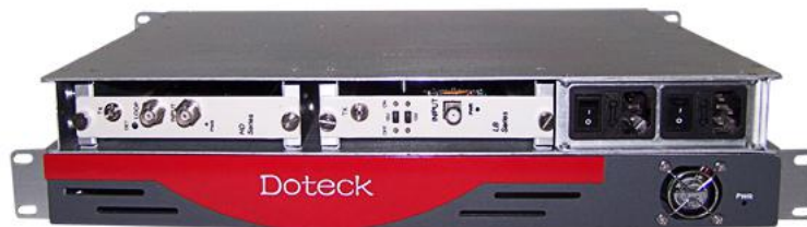
2-slot, 19-inch, dual power supply